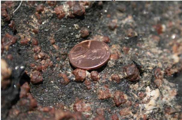
Garnets in eclogite