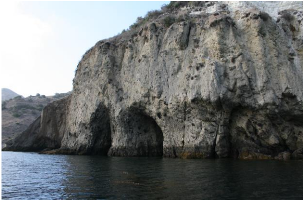
Sea caves in volcanic breccia