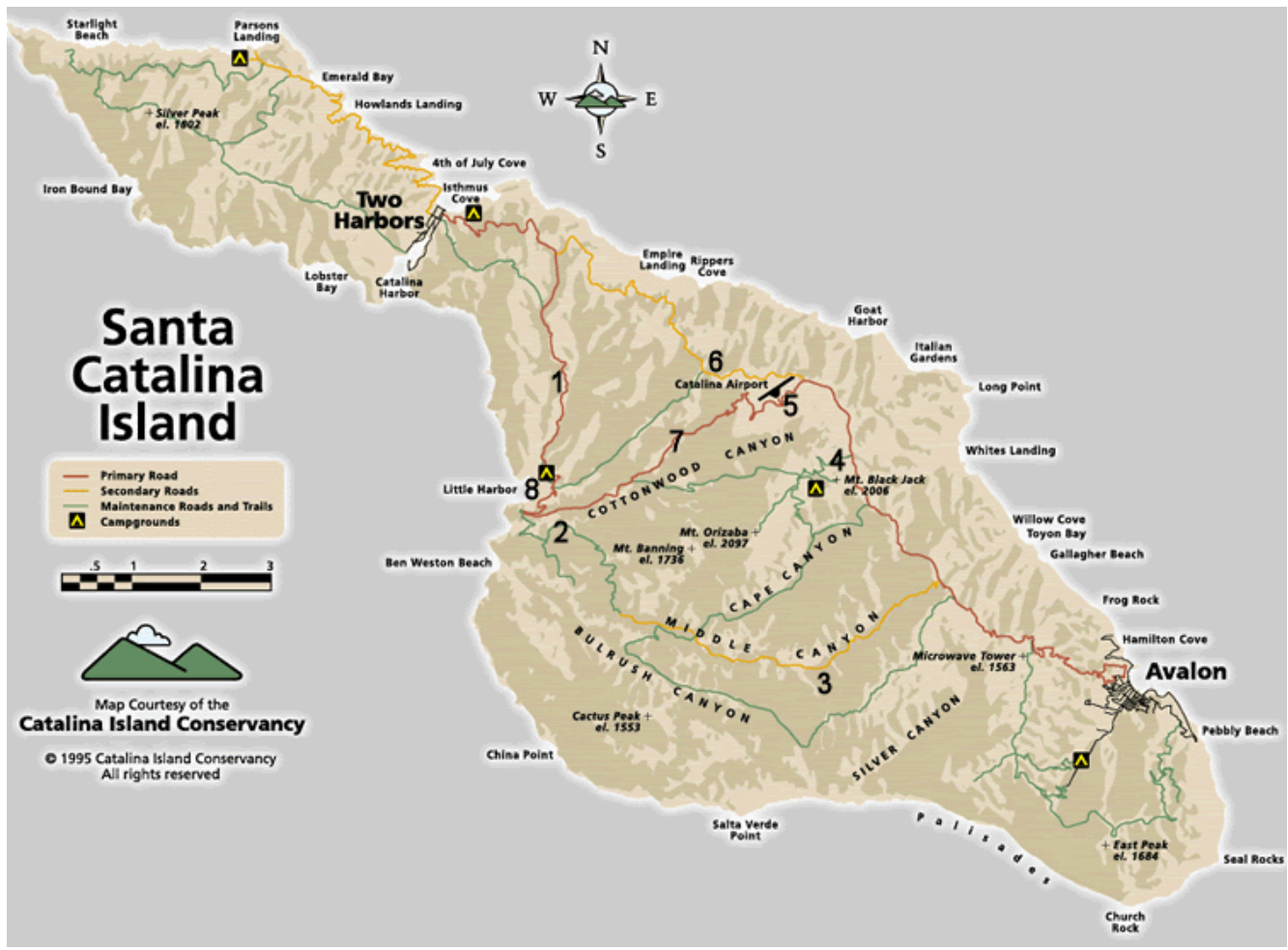
Figure 2: Map of Catalina Island showing locations of stops on Saturday.