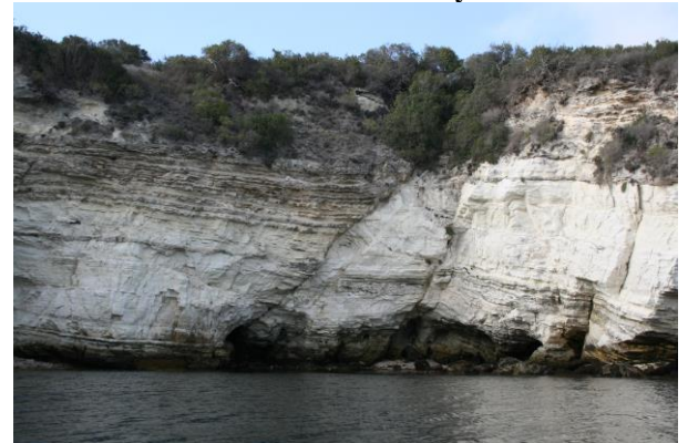
Normal fault in Monterey Shale